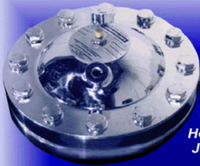
With Heating Jacket